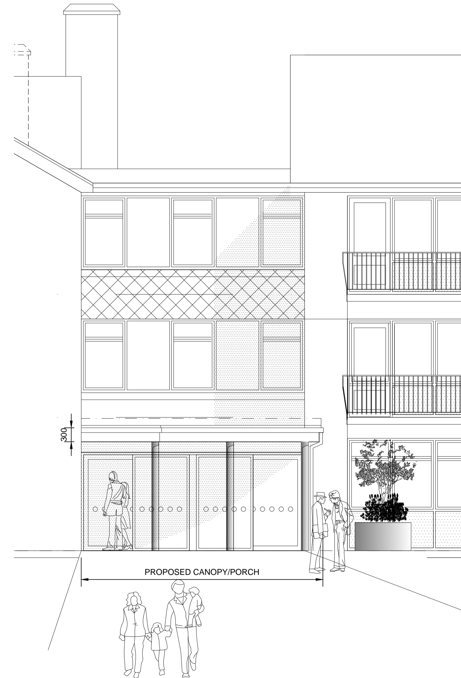
Proposed South Elevation (Canopy/Porch) 1:50